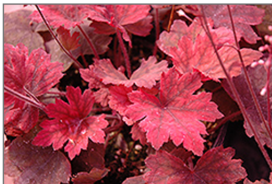
Sweet Tea Foamy Bells foliage

Sweet Tea Foamy Bells is recommended for the following landscape applications;