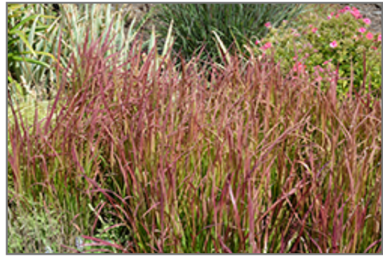
Red Baron Japanese Blood Grass

Red Baron Japanese Blood Grass will grow to be about 20 inches tall at maturity, with a spread of 18 inches. It grows at a slow rate, and under ideal conditions can be expected to live for approximately 20 years. As an herbaceous perennial, this plant will usually die back to the crown each winter, and will regrow from the base each spring. Be careful not to disturb the crown in late winter when it may not be readily seen!