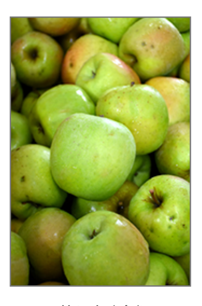
Mutsu Apple fruit

Mutsu Apple features showy clusters of lightly-scented white flowers with shell pink overtones along the branches in mid spring, which emerge from distinctive pink flower buds. It has forest green deciduous foliage. The pointy leaves turn yellow in fall. The fruits are showy light green apples with a gold blush, which are carried in abundance from mid to late summer. The fruit can be messy if allowed to drop on the lawn or walkways, and may require occasional clean-up.