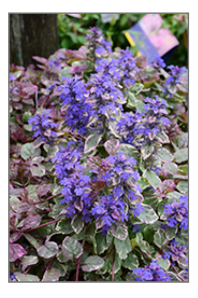
Burgundy Glow Bugleweed flowers

Burgundy Glow Bugleweed is a dense herbaceous evergreen perennial with a ground-hugging habit of growth. Its medium texture blends into the garden, but can always be balanced by a couple of finer or coarser plants for an effective composition.