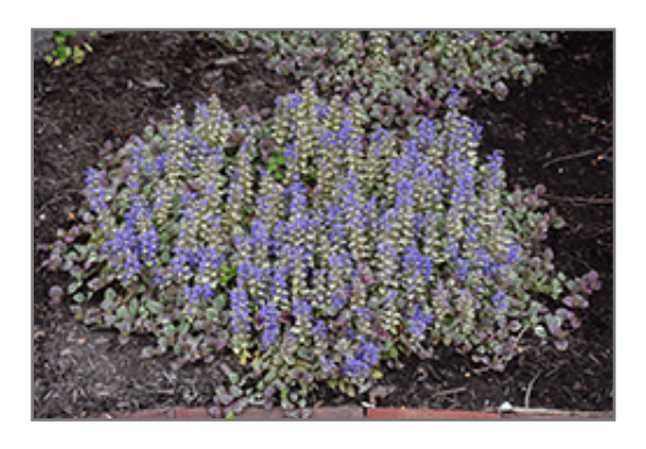
Burgundy Glow Bugleweed in bloom

Burgundy Glow Bugleweed is a fine choice for the garden, but it is also a good selection for planting in outdoor containers and hanging baskets. Because of its spreading habit of growth, it is ideally suited for use as a 'spiller' in the 'spiller-thriller-filler' container combination; plant it near the edges where it can spill gracefully over the pot. Note that when growing plants in outdoor containers and baskets, they may require more frequent waterings than they would in the yard or garden.