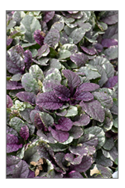
Burgundy Glow Bugleweed foliage