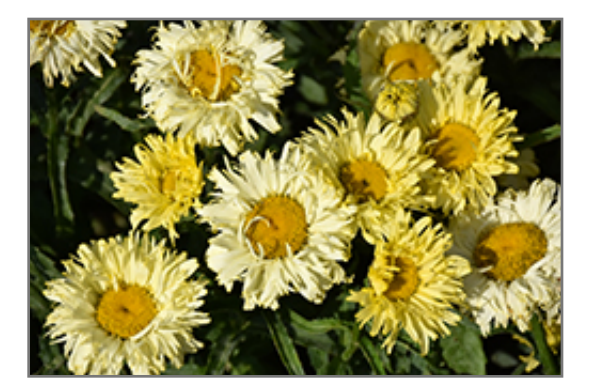
Goldfinch Shasta Daisy flowers