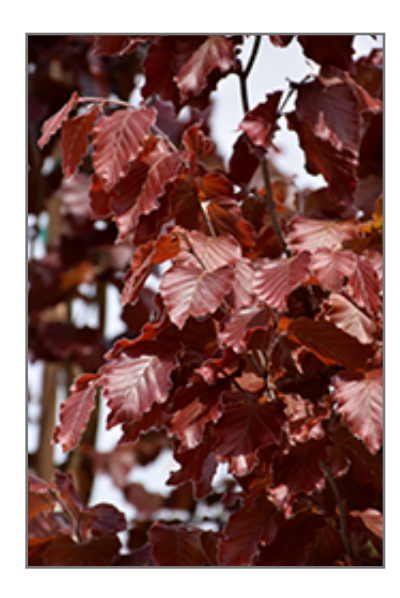
Red Obelisk Beech foliage