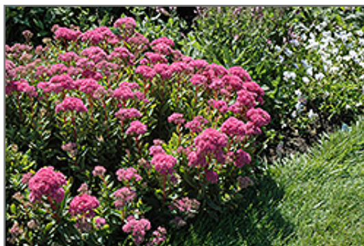
Carl Stonecrop in bloom