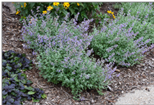
Purrsian Blue Catmint in bloom