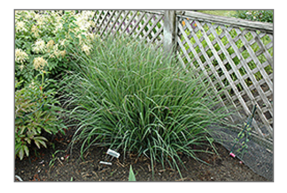
Indian Warrior Bluestem