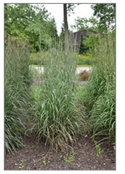
Indian Warrior Bluestem in bloom