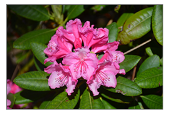
Haaga Rhododendron flowers

A relatively new broadleaf evergreen shrub with rich deep pink flowers in spring, coarse dark foliage and an upright mounded habit, quite hardy; absolutely must have well-drained, highly acidic and organic soil, use plenty of peat moss when planting