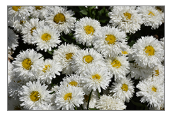
Laspider Shasta Daisy flowers