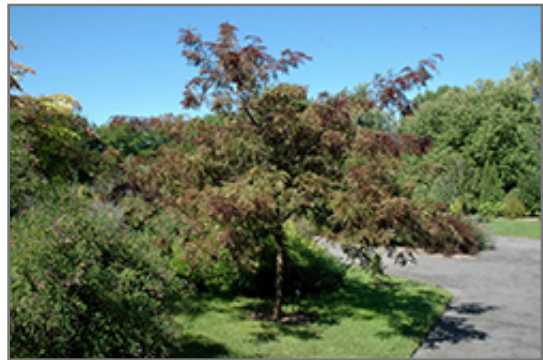
Ruby Lace Honeylocust